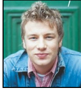
JAMIE OLIVER THE NAKED CHEF 2